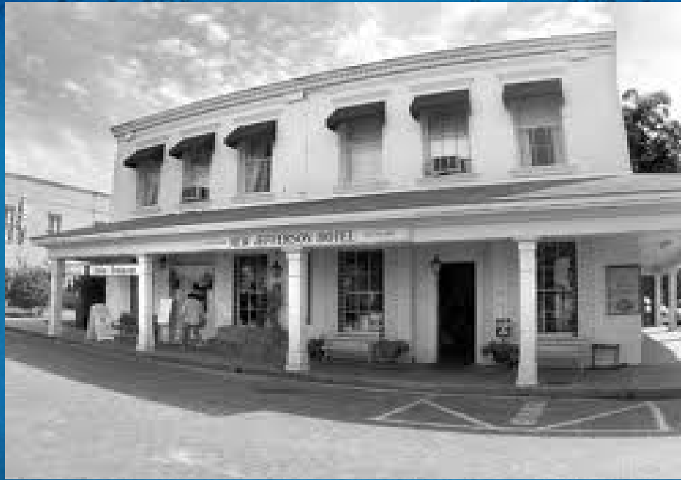
The Jefferson Hotel after it was burned down during the Civil War